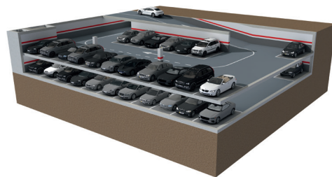
Conventional underground car park